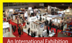
An International Exhibition

AgriLivestock Cambodia'18 is an integrated event for the agriculture industry which will include