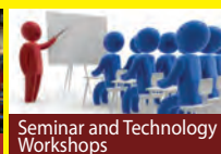
Seminar and Technology Workshops